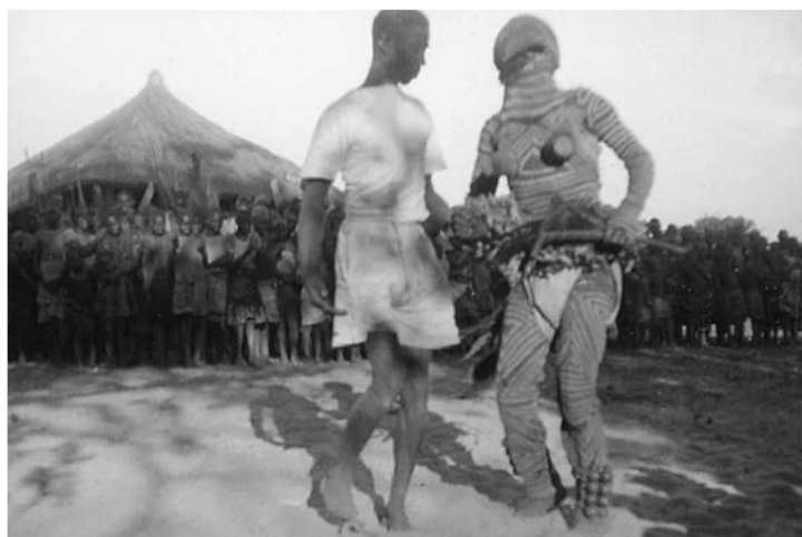
Imitating coitus, with man foil. This forms part of the dance of Nyalindele.

Photograph by Max Gluckman, 1940. RAI 29602. © Royal Anthropological Institute of Great Britain and Ireland.