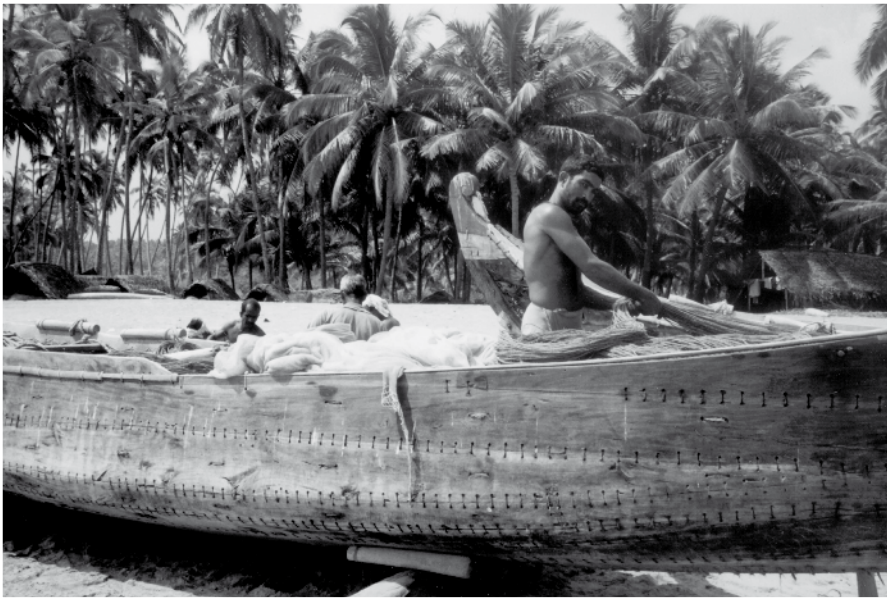
A fisherman loading the boats with nets. Thrivumbadi Beach, Kerala, India, Oct. 2003.