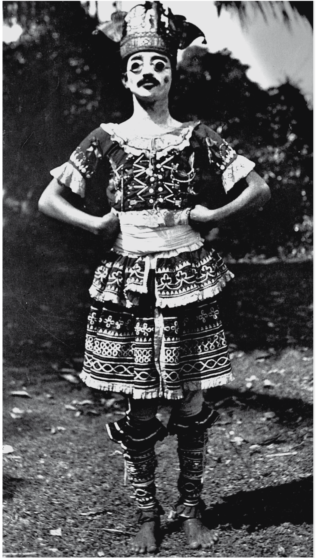
The devil dancer's assistant wearing the costume of the green-eyed Daba-ata-pillépali, one of the principal devils of the 18 who cause sickness; before afflicting men, lesser devils must ask his permission. Sri Lanka, c. 1903-4.