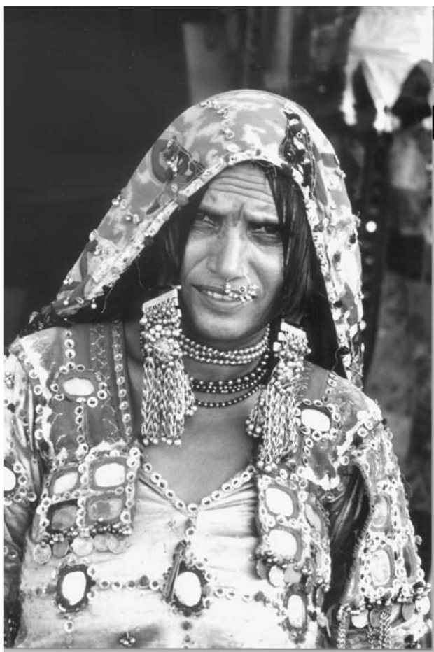
Woman from Karnataka (Handicraft Seller). Kerala, May 2003.

Telephone: 020 70323 8031 E-mail: AnthropologyLibrary@thebritishmuseum.ac.uk